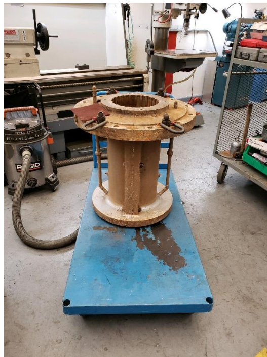
Lower guide bearing

JD maintenance is expecting once parts arrive that the turbine pump can be returned to service within a week.